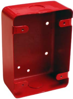
MRM-700 Surface Mount Backbox