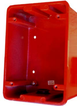
MRM-700WP Weatherproof Surface Mount Backbox